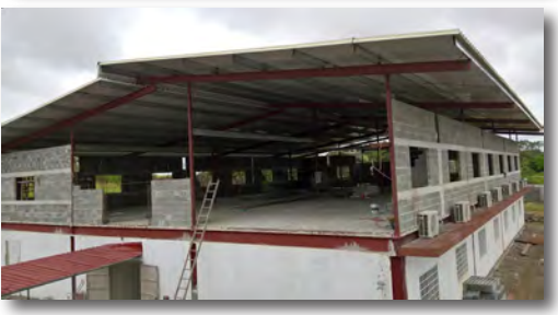
Action Bible Distributions Begin Two Teams Advance LARTC Construction & Prayer Needs & Praise Reports on the reverse side!